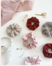
Term Classes - Ages 8+