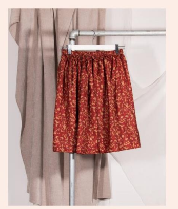
School Holiday Workshops & Term 4 Classes - Ages 8+ See website for all sewing classes: www.threadroom.co.nz