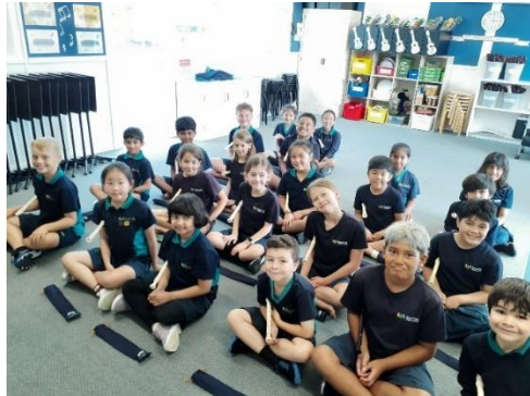
Very impressive Karaka Room Recorder players this week.

And how fabulous to see our new Recorder learners in Year 4, Year 5, and Year 6 approach this new instrumental skill with such positivity and focus. What a great start to our ROPS Recorder-playing year!