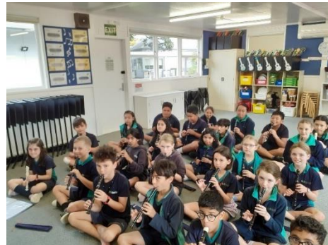
A Tōtara Music Group – The start of their Recorder Journey