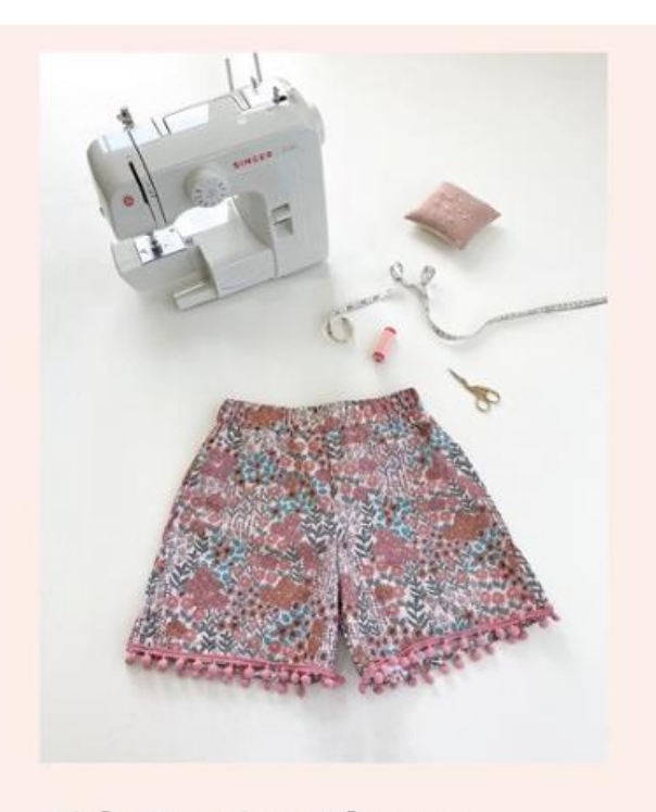
Kids Sewing Classes

School Holiday & Term 1 Classes Zest Education Centre