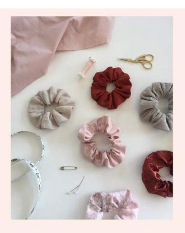
Learn to Sew School Holidays & Term 1 Thread Room - Remuera