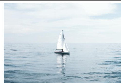
Sailing boats on the sea - hopefully what Manuka's boats turned out like!

"My boat won!" exclaimed some students. The Chinese Rat boat filled up with mucky water and the soggy paper flag drooped sadly over the soaked picture of the Chinese Rat. "Better luck next time!" said some people.